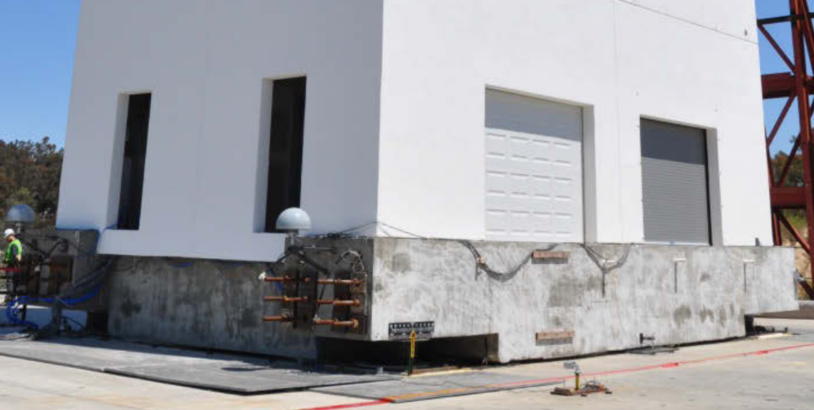
PHOTO: The University of California, San Diego, has a $250,000 grant to research Precast Concrete Cladding Subsystems—Detailing for Regions of High Seismicity. The purpose is to understand experimentally the effects of dynamic loading on precast concrete cladding façade systems, and to allow a new realistic assessment of the performance of the concrete cladding, its steel connections, and punch-out windows.